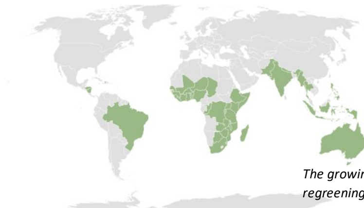
The growing network of regreening contractors